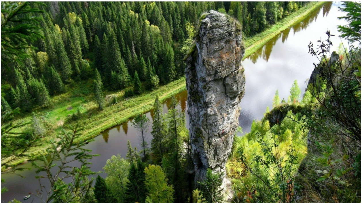
Stone pillars Usva Perm krai